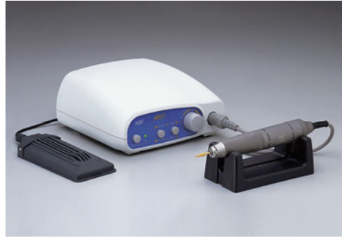
Standard Micromotor System