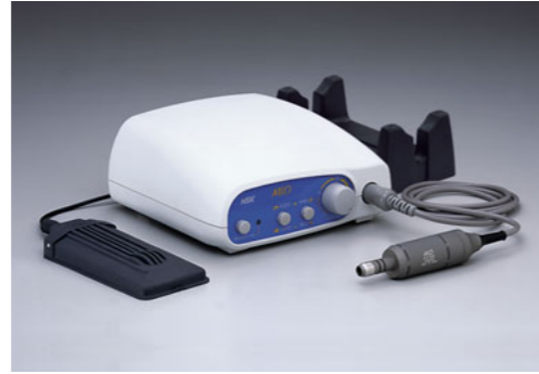
E-Type Micromotor System without Handpiece