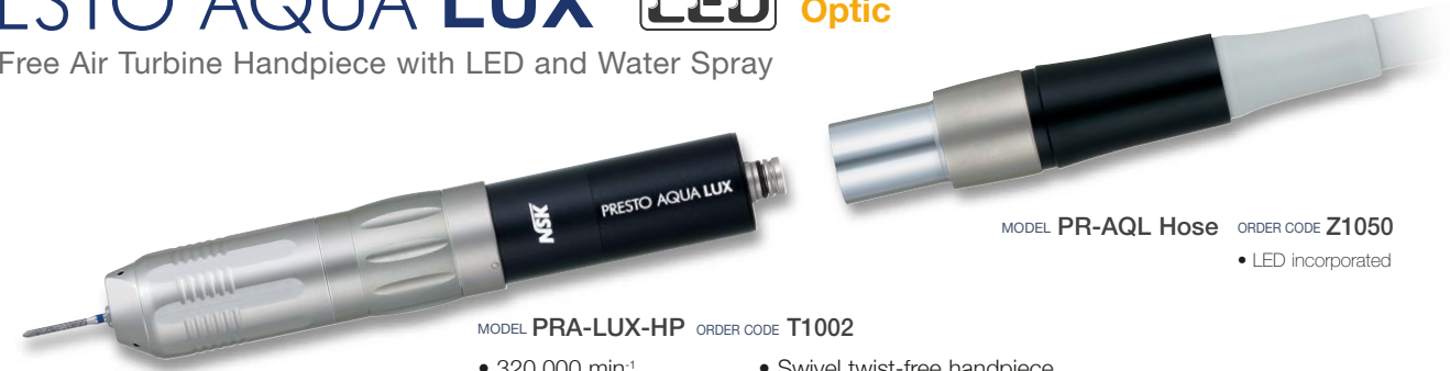
MODEL PR-AQL Hose ORDER CODE Z1050 • LED incorporated

Lube Free Air Turbine Handpiece with LED and Water Spray