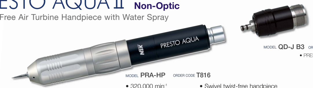
MODEL QD-J B3 ORDER CODE T354051 • PRESTO AQUA coupling

Lube Free Air Turbine Handpiece with Water Spray