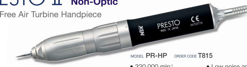
MODEL PR-HP ORDER CODE T815